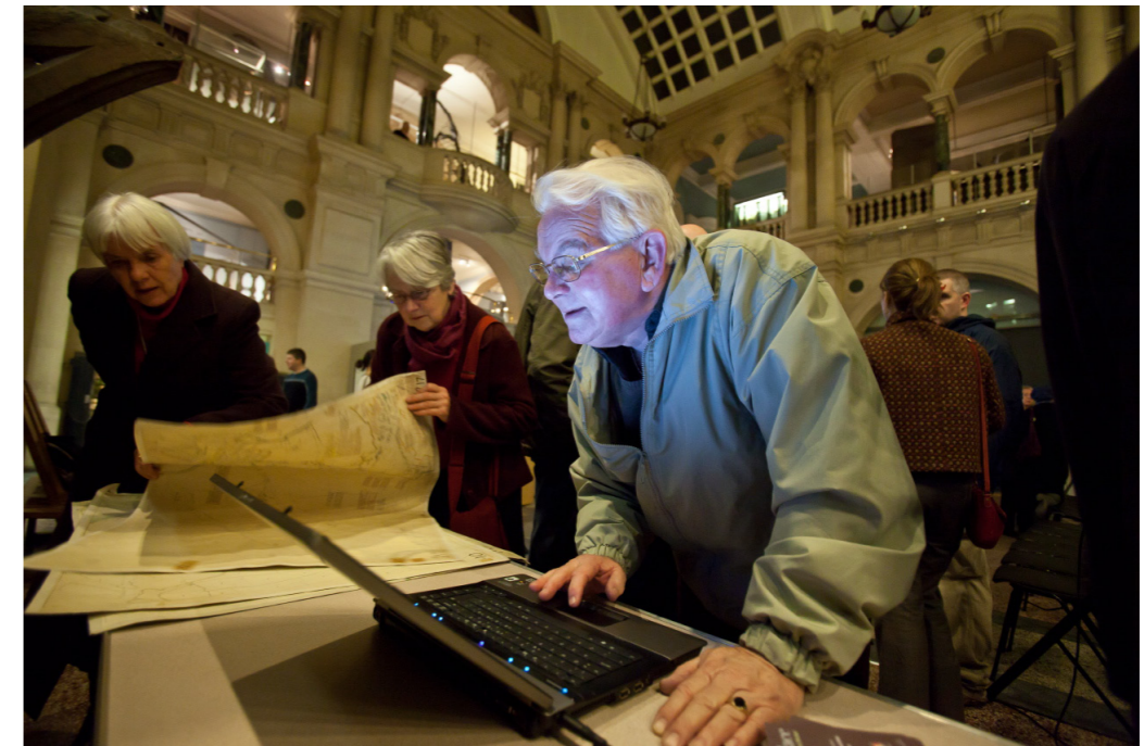
Recent launch event where the website was demonstrated. Public were able to view some of the original maps.