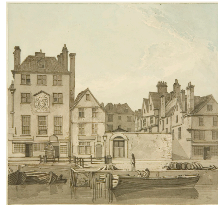
The Old Custom House on Welsh Back, Bristol in 1823. Hugh O'Neill Braikenridge Image Layer.