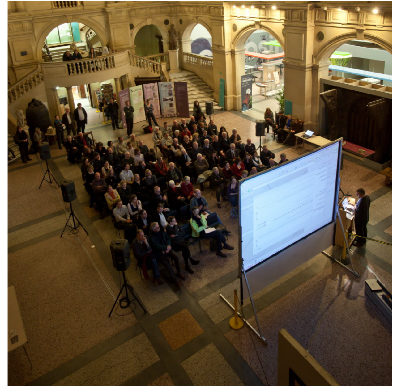
Know Your Place was launched at a public event at the Bristol City Museum and Art Gallery.