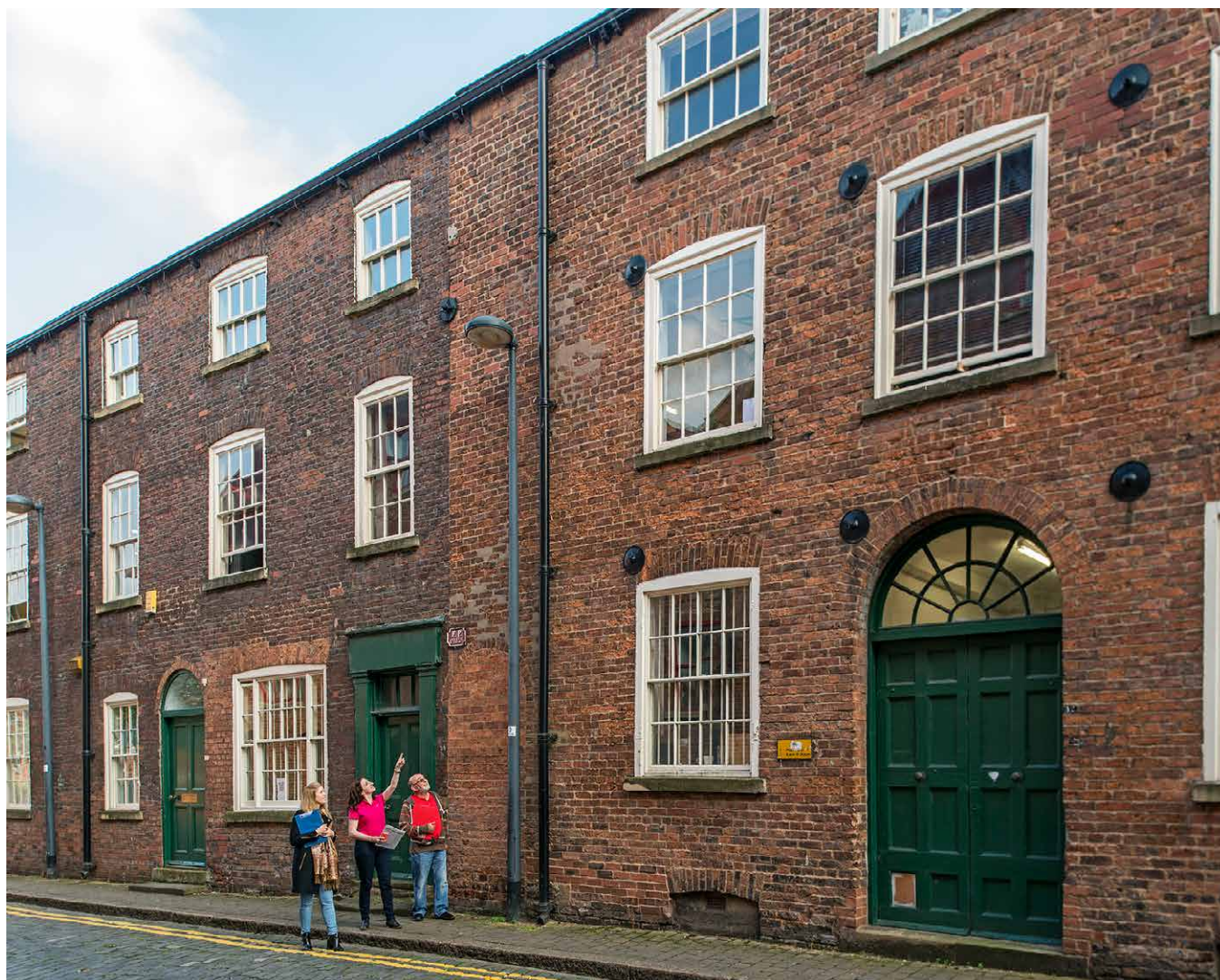
Image Church Row, Leeds, West Yorkshire.

Further data on the social and economic value of the historic environment is available from the Heritage Counts website and the Taking Part Survey . The Local Authority Profiles may be of particular interest as they illustrate the scope of heritage at the local authority level.